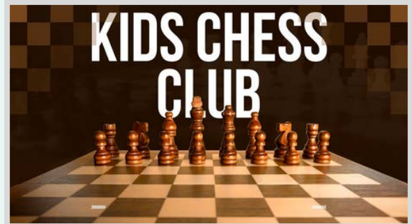
February 22nd 6:30pm - 7:30pm Registration required