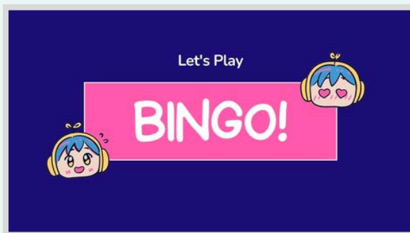
February 29th 6:30pm-7:30pm Registration required

“ There are many little ways to enlarge your child's world. Love of books is the best of all. --Jackie Kennedy ”