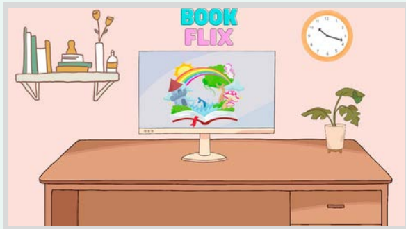
FEBRUARY 21st 10am-11am Registration required